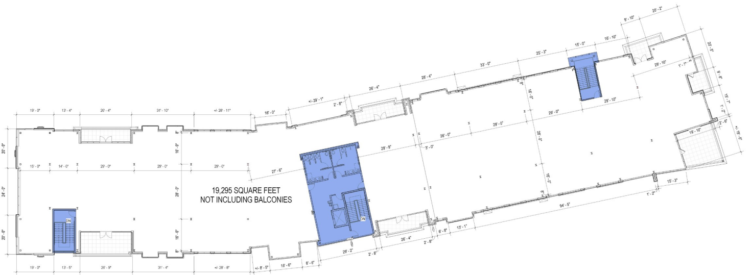
LEVEL 3 OVERALL PLAN 1/16" = 1'-0"

21,185 S.F. OVERALL SQUARE FOOTAGE (hatched) 1,890 S.F. COMMON AREAS (blue) 19,295 S.F. LEASABLE